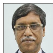
Dr Nemai C Nath Surgery, Bengal