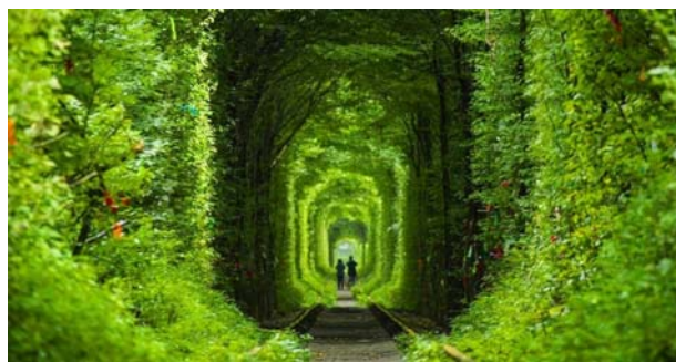
Fig 2 — Picture of “Ukraine” Tunnel of Love

Thus though the mystery behind the term “TOL” remains unsolved, it’s a mysterious excitement in the