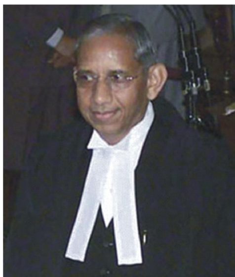
Justice Ramesh Chandra Lahoti