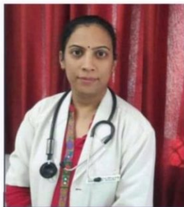
Obstetrics and Gynecology (GOLD MEDALIST)