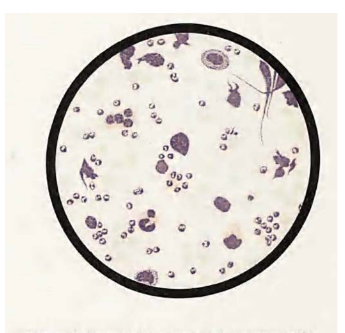
Leishmania Donovanii in a smear from the scrapings of the papillomatous nodules,