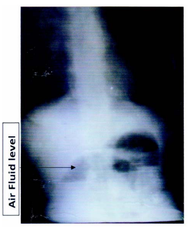
Fig 1 — Straight X-ray abdomen

Department of General Surgery, Calcutta National Medical College, Kolkata 700014 <sup>1</sup>MBBS, MS, Professor <sup>2</sup>MBBS, MS, RMO cum Clinical Tutor and Corresponding author <sup>3</sup>MBBS, MS, Assistant Professor <sup>4</sup>MBBS, Postgraduate Trainee