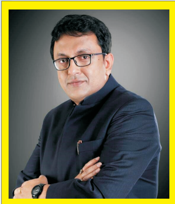
Dr Santanu Sen, MP National President Elect, IMA (2018-2019)