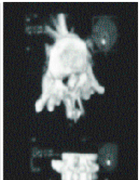
Fig 4 — CT, scan 3D reconstruction axial view. Bullet in vertebral canal