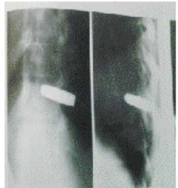
Fig 1 — X-ray plain shows bullet