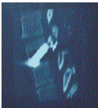
Fig 2 — CT scan shows bullet precisely