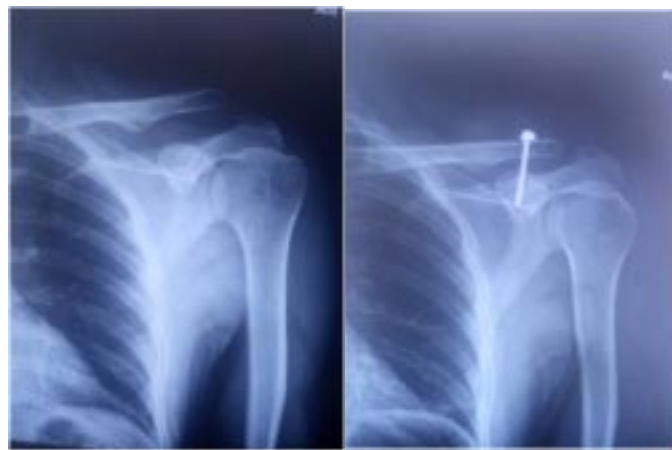
Fig 2 — Pre and postoperative AP radiograph of AC joint injury