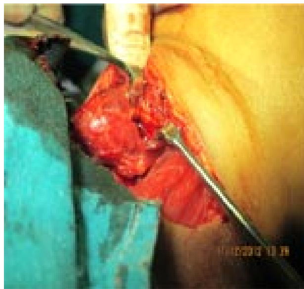
Fig 4 — Showing intraoperative photograph of left thyroid lobe explored

Ingestion of a fish bone is a common otolaryngological emergency. This occurs frequently in Asian populations, where it is common to eat fish that has not been deboned. Although fish bones will spontaneously pass through the digestive tract, most fish bones are impacted at the tonsils or base of the tongue and can be removed easily with minimal morbidity. Fish bones retained in the oesophagus can result in complications such as retropharyngeal abscess, perforation of