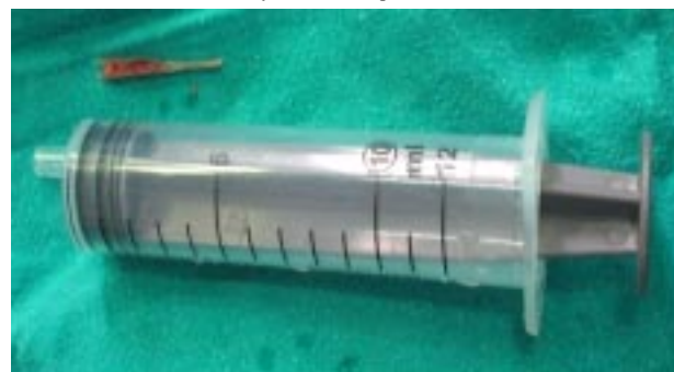
Fig 5 — Approximately 2 x 0.25 cms fish bone is retrieved

sonography and a CT scan of the neck are considered the most helpful diagnostic tools to determine the size, type, location and orientation of a migrated fish bone and its relationship to the other structures of the neck. Exploration for a migrated F.B. from oesophagus in thyroid gland is a challenging task. Here in our case fish bone was removed after careful splitting of thyroid lobe without doing lobectomy.