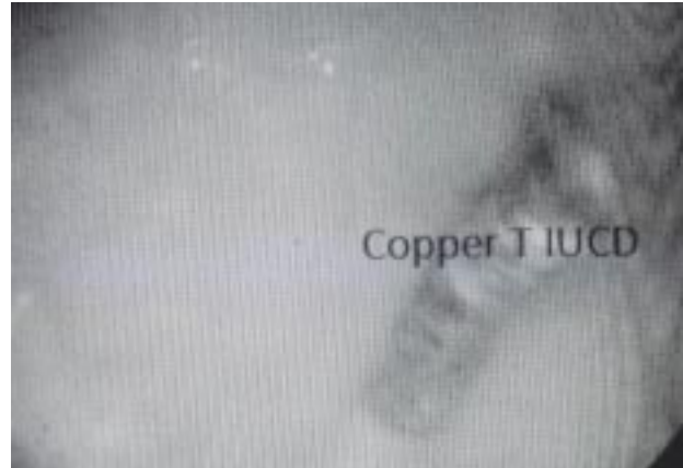
Fig 3 — Cystoscopy showed the stem of copper T in the lumen of the urinary bladder without any surrounding inflammatory reaction

All the IUCD in the bladder must be removed, whether they are