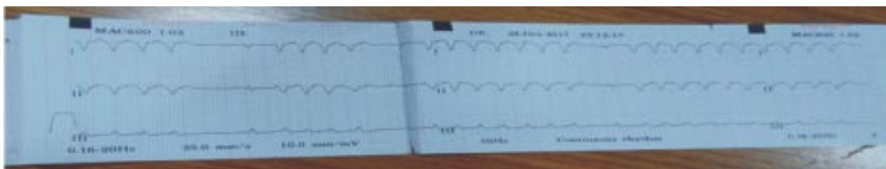
Fig 2 — Showing Non-sustained Ventricular Tachycardia

We searched PubMed database for articles published since 1975. Medical subject headings(MeSH) including dengue, myocarditis,