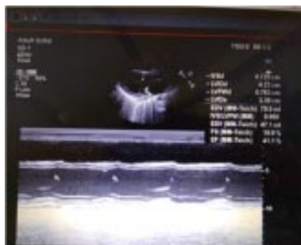
Fig 3 — Showing Dilated LV