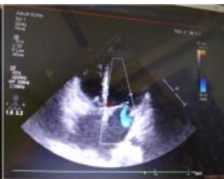
Fig 4 — Showing Mitral Regurgitation