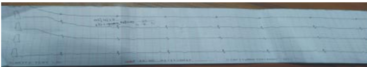
Fig 1 — Showing complete AV Dissociation

ceftriaxone 500 mg twice a day IV was continued for 5 days (2 days after the patient became afebrile), during the whole admission period he was under close observation in ICCU. After 2 days his BP became 110/70 mm of Hg, so we stopped fluid therapy but his pulse rate remained around 48-50/min. Temporary pacing was not done as there was no symptoms related to bradyarrhythmia. We performed regularly platelet count & TLC which were never came down and Hematocrit which was never gone up. He was kept under observation for 12 days after he became afebrile but no warning features developed except his pulse rate was around 48-50/min. Two weeks after discharge on follow up his BP was 110/70 mm of Hg and Pulse was irregular with average rate 68/min although ECG showed intermittent 2:1 AV block. Still we are following the patient at our OPD at regular basis.