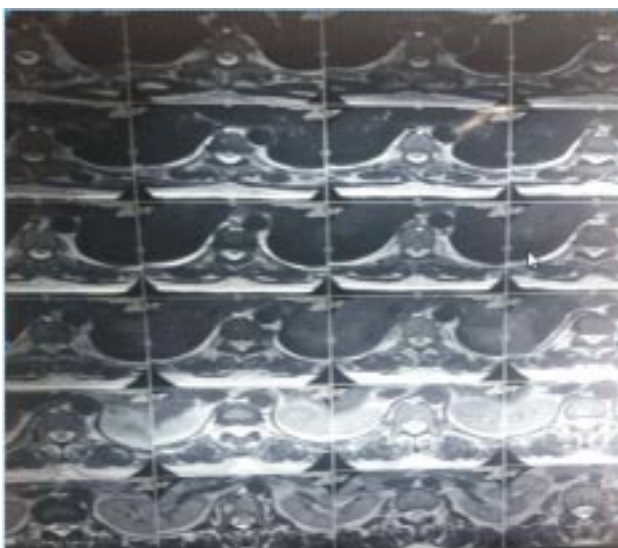
MRI of dorsal spine

Our patient had no pre-existing neurological disorder; she was suffering from diabetes mellitus for eleven years and hypothyroidism for nine years but under control. Rest of the preoperative investigations were normal. Strict aseptic precautions were taken during spinal puncture and the same batch of local anaesthetic was used for many other patients. Immediate post-operative MRI was transverse myelitis which was triggered by spinal anaesthesia was the probable cause of the paraplegia, subsequently quadriplegia and respiratory muscle paralysis leading to her death.